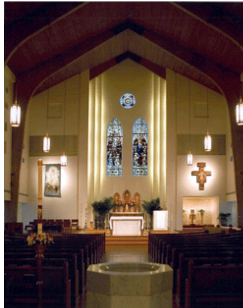
The interior of Blessed Sacrament Catholic Church, 2008

These young musicians from the Norfolk Public Schools Gifted and Talented program will offer holiday selections as they stroll the church.